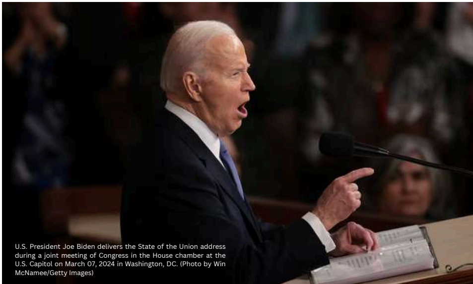
U.S. President Joe Biden delivers the State of the Union address during a joint meeting of Congress in the House chamber at the U.S. Capitol on March 07, 2024 in Washington, DC.

The U.S. military will establish a temporary port in the Gaza Strip to deliver humanitarian aid to starving Palestinians, while continuing to send weapons to Israel, President Joe Biden confirmed in his State of the Union address Thursday.